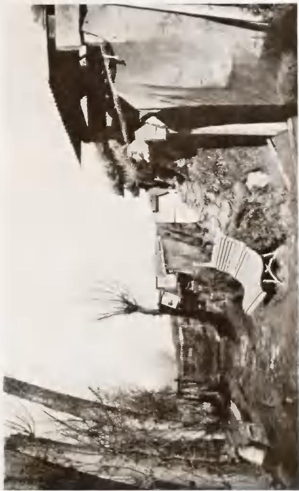
TRENCH BATTALION HEADQUARTERS, November, 1915—February, 1916.