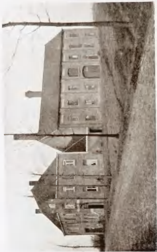
PLOVER, N. D. The Brewery—The Battalion's First Bath house.