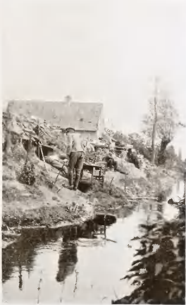
BATTALION HEADQUARTERS. 11th May, 1915.