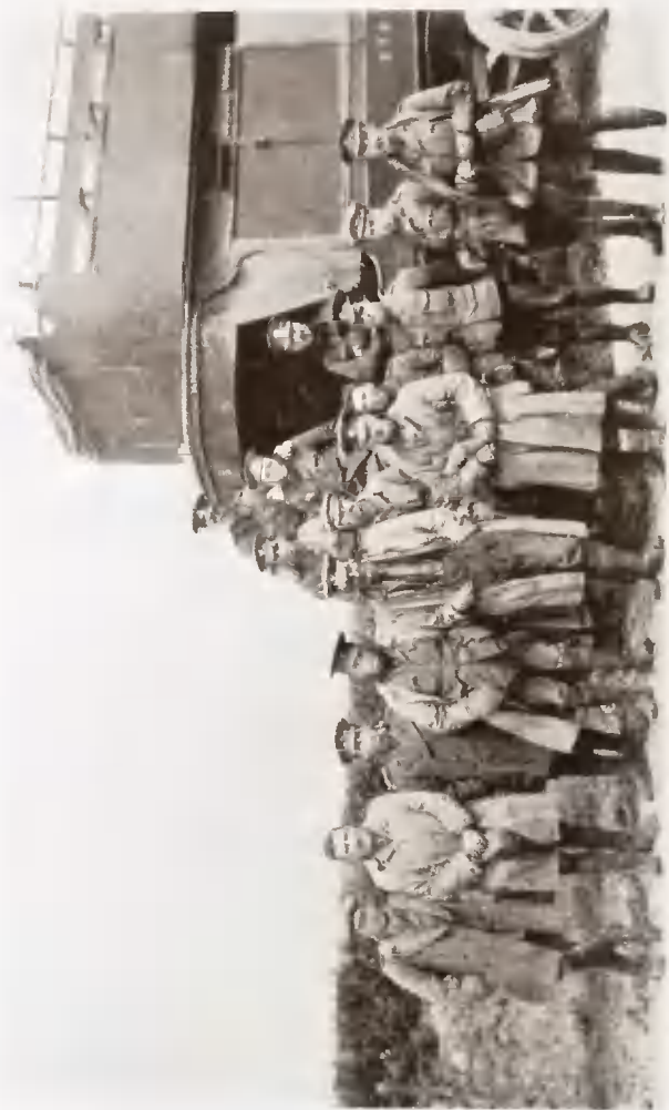
OFFICERS. 20th May, 1915.