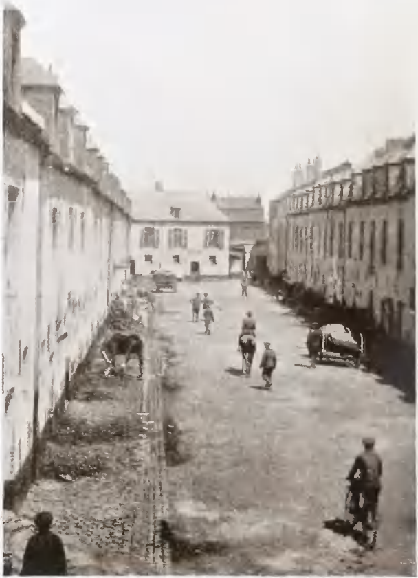
THE BARRACKS, GENERAL HEADQUARTERS.