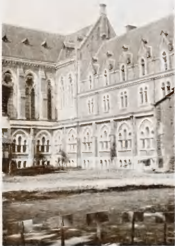
THE CONVENT. 8th to 16th November, 1914.